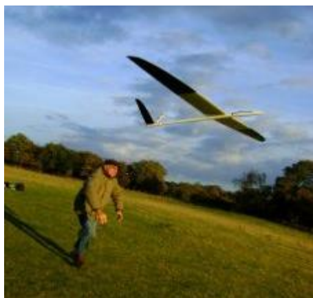
Model aircraft slope soaring

However, model flying conducted outside of clubs/associations does remain within the scope of EASA regulations and will fall within the 'Open Category' which imposes requirements for registration and proof of competency on the operator, as well as a default age limit of 18 years. We have told DG MOVE that this age restriction is likely to present a barrier to participation, is disproportionate and not based on any genuine analysis of the risk.